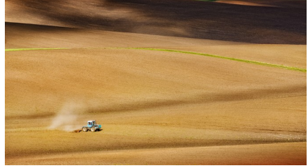
Tractor in a Ukrainian field

Ukraine is the wheat's grain of the West. Russia and China are competitors for the United States and especially finance, which wants to divide and conquer.