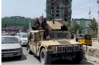
Taliban convoy in 2021

NATO makes war in Afghanistan to destabilize China. The NGOs created there grab the money provided for Afghan people. However, the Taliban, an ethnic group united with Afghan people by same religion, will always have fought against drugs. NATO is installing poppy cultivation in the country.